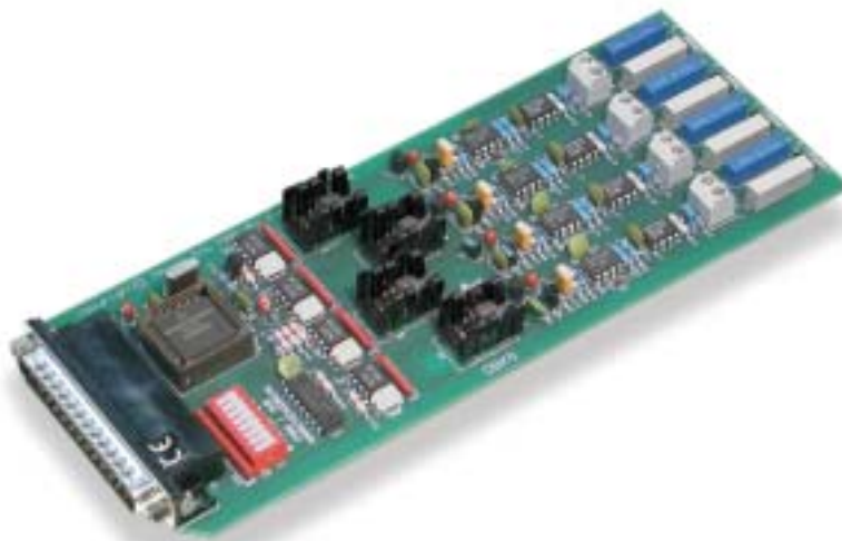
The DBK5 current-output card controls four isolated 4 to 20 mA current loops

The DBK5™ current-output card provides IOtech's data acquisition systems with the ability to control four isolated 4 to 20 mA current loops. The DBK5 acts as a current loop transmitter by modulating current from an external source. The DBK5 can be programmed with a static value whenever the data acquisition system is not transferring A/D data. As many as 64 DBK5s can be used in one system to obtain up to 256 outputs.